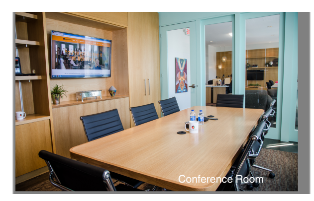
Special Intro offer valid for membership initiated by 5/1/24. Only one office available.