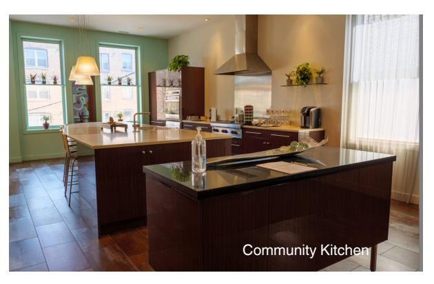
Special Intro pricing valid for bookings thru 5/31/24. Based on availability.

Book Online at SuiteSpotte.com Available during business hours Monday thru Friday 8:30 AM - 5:00 PM