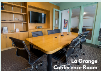
La Grange Conference Room