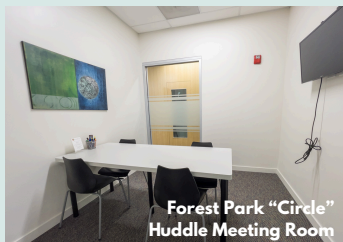
Forest Park “Circle” Huddle Meeting Room