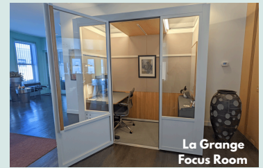
La Grange Focus Room