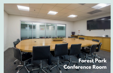
Forest Park Conference Room