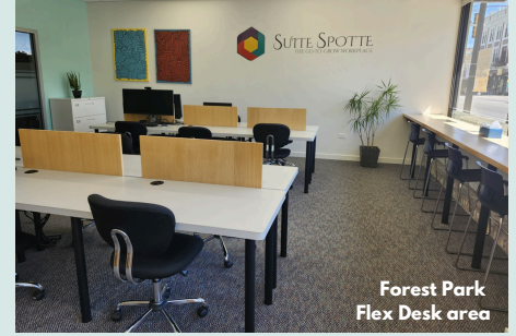
Forest Park Flex Desk area

Open, shared flex desk use 32 HOURS meeting room/day office allowance per month $350/month