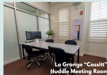
La Grange “Cossitt” Huddle Meeting Room