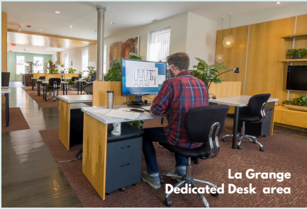
La Grange Dedicated Desk area