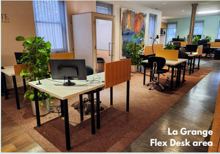
La Grange Flex Desk area

Suite Spotte’s HYBRID membership upgrades our Frequent Spotter (flex desk) and Resident Spotter (dedicated desk) memberships with more private workspace use.