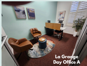
La Grange Day Office A