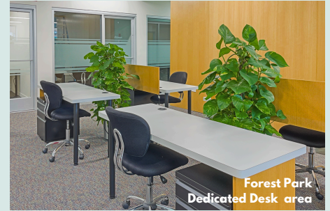
Forest Park Dedicated Desk area

60" dedicated desk in semi-private area lockable pedestal file cabinet 32 HOURS meeting room/day office allowance per month $475/month