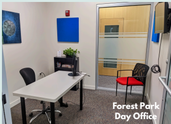
Forest Park Day Office